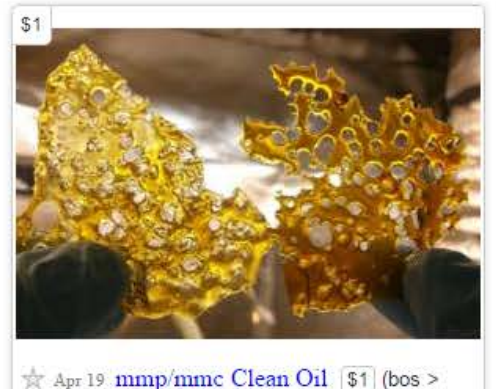
☆ Apr 19 mmp/mmc Clean Oil $1 (bos > Ma/Rl) 🕱