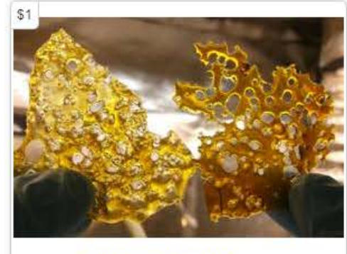
☆ Apr 19 mmp/mmc Clean Oil $1 (bos > Ma/RI) ເ