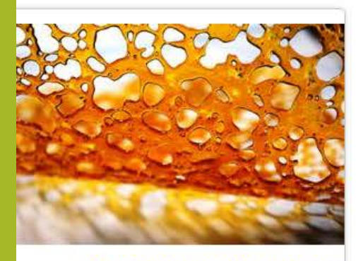
☆ Mar 21 MMP MMC ONLY Making rso bho and shatter butter (sma) ₪